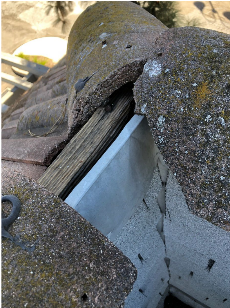
Building 6 - SE Corner with Missing Concrete Tile