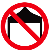
Canopies or umbrellas