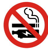
Smoking or vaping