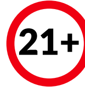
Anyone under 21 years of age