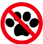
Pets. Service animals welcome