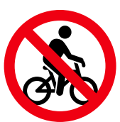
Riding bikes, scooters, skateboards, etc. in the event area