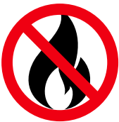
Open flames (candles, BBQs: charcoal or propane)