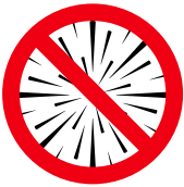
Fireworks and sparklers