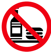
Outside food or open beverage