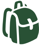
Small backpacks & purses