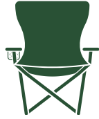
Folding, camping or lawn chairs