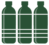
Factory-sealed water bottles