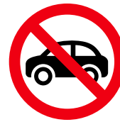
Motorized/battery powered vehicles, bikes, scooters, etc.