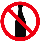
Glass bottles or containers